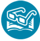
Reasoning Through Language Arts